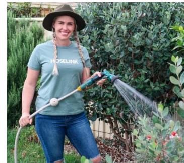
Exhibit Space Selling Well for Buyers Expo

It's certainly no surprise to CNGA folks that the pandemic had a huge unintended consequence - lots of people started gardening who had never gardened before. Now that the stay at home part of the pandemic has passed, can you keep those new gardeners gardening? By promoting the health benefits of their efforts, perhaps you can. In a recent survey with more than 3,700 respondents (who primarily lived in the U.S., Germany and Australia) most gardeners seemed to either experience a heightened sense of joy and reassurance, or feel more attuned to the natural world. This seemed to have positive therapeutic and psychological benefits, regardless of age or location. Remind your customers that, whether they realize it or not, their gardens are conduits to health! Read the article.